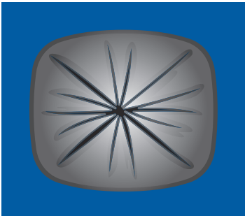
STAR SEAL BOTTOM

SCS Global Services does hereby certify that an independent assessment has been conducted on behalf of: